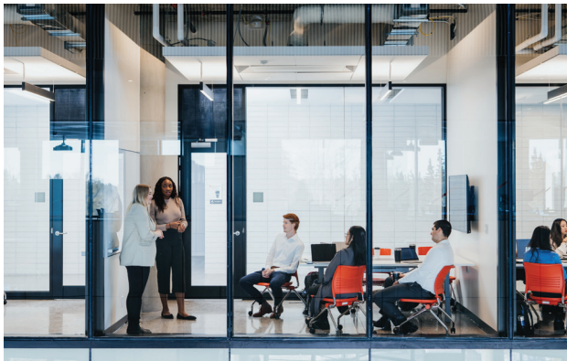
Dedicated areas for focused study and group work