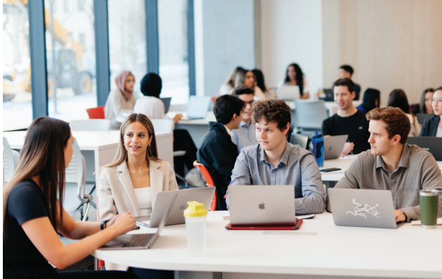
12 new technology-enhanced classrooms

Student-focused by design, the building reflects the complete student experience including: