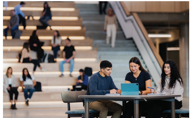
Ample touchpoints for socialization and connection

"We were very excited to support the Haskayne School of Business in the creation of Mathison Hall as we have seen the school's positive impact over the past eight years training and educating future leaders. Our hope is that this unique space will provide more opportunities for students, faculty and business leaders to collaborate, engage in open dialogue and continue to challenge and learn from one other."