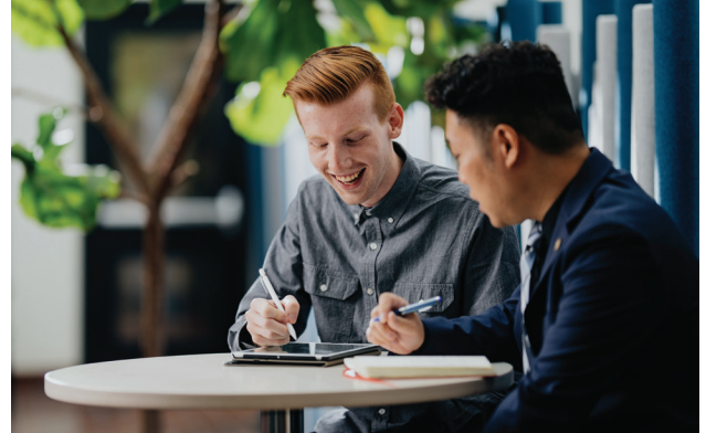
Student Services Centres