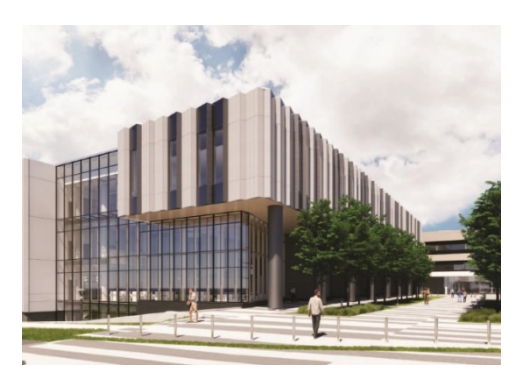
Mathison Hall will open its doors to students in 2022.

A much-needed expansion to the learning space for business students is now under construction thanks to generous philanthropic support from community leaders. Mathison Hall will accommodate Haskayne's growing number of students and provide an environment that complements evolving teaching methods. The new building will be a place for members of the Haskayne community to collaborate, study and learn together and will support the growth of the MBA, Master of Management (MMgmt), Doctor of Business Administration (DBA) and Bachelor of Commerce (BComm) programs.