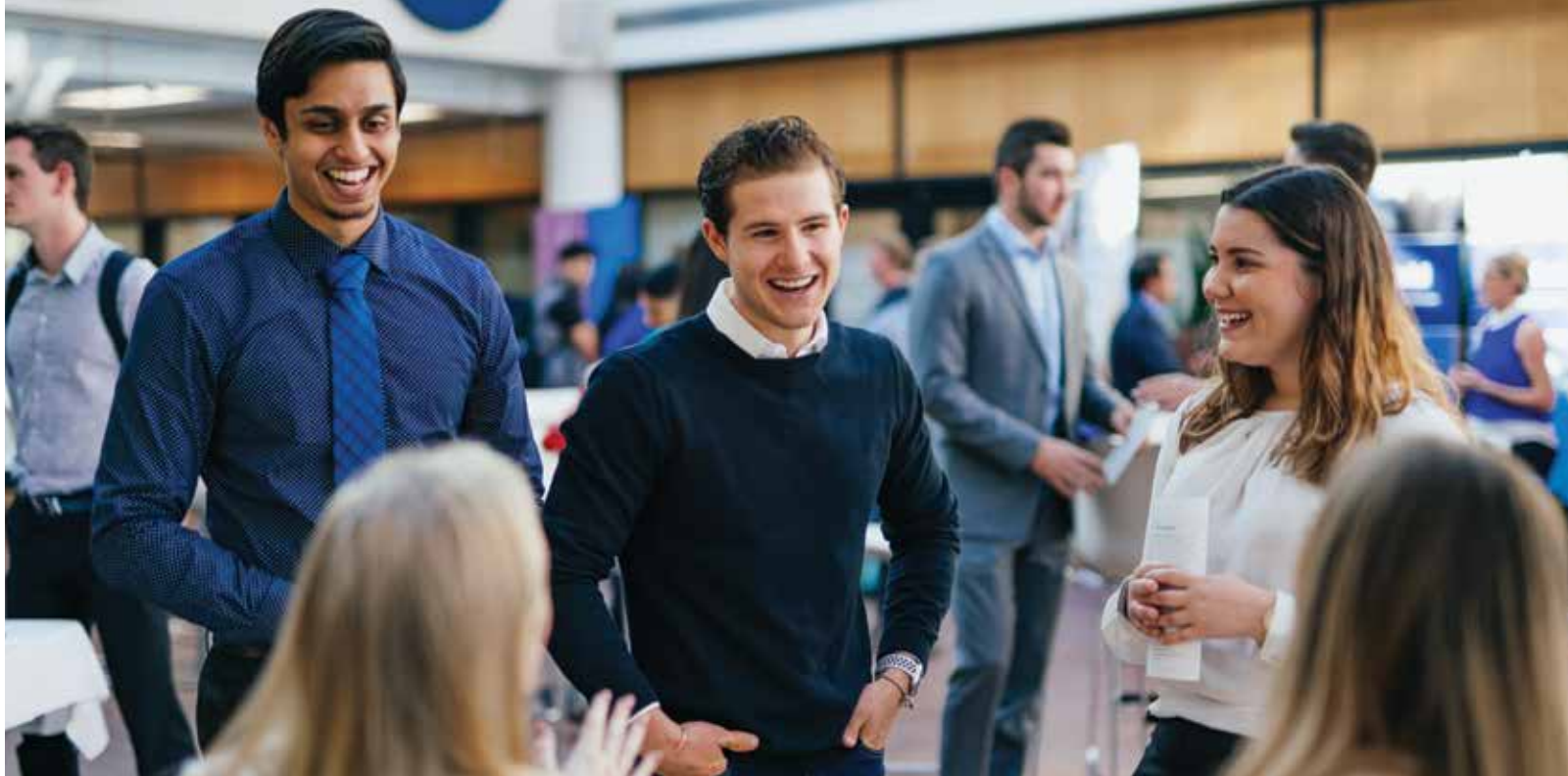
▲ Students and industry professionals connect at the 2018 Real Estate Industry Career Symposium and Networking Reception.