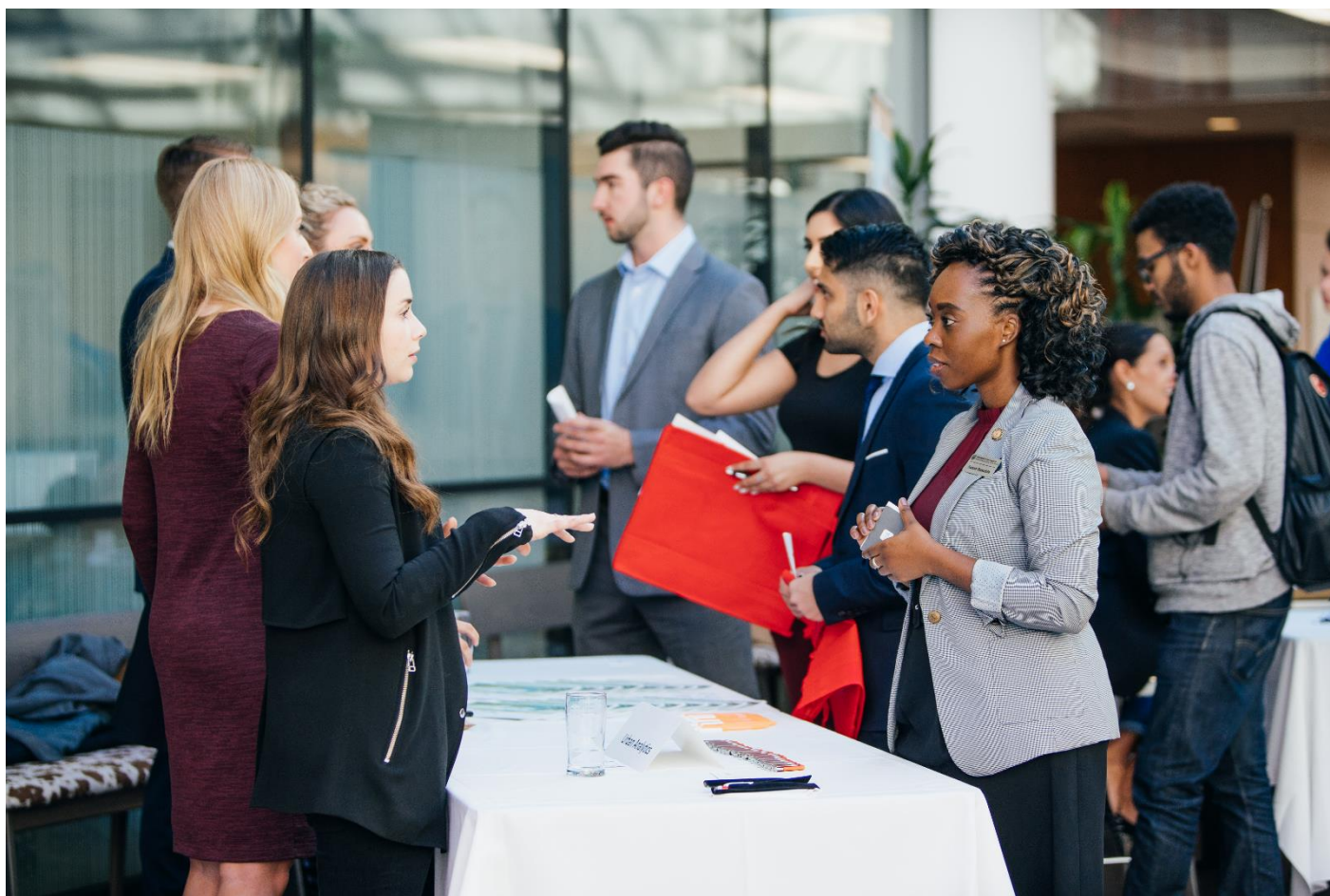
Students and industry professionals connecting at the Real Estate Industry Career Symposium & Networking Reception.

Through their own initiative and by leveraging the opportunities presented to them through the Westman Centre and the Real Estate Students Association (RESA), Haskayne students are finding permanent jobs, co-op work terms and summer internships across a diverse spectrum of companies in the real estate industry. The list of companies that are hiring our students includes Avison Young, Altus, ATB Financial, Avenue Asset Living, Crombie REIT, Brookfield Residential, Brookfield Properties, CBRE, Colliers, CWB Financial Group, MATCO Developments, Omni Group, Oxford Properties, Stantec, Strategic Group, Urban Analytics and West Campus Development Trust, to mention a few. Positions include credit assistant, consultant, development intern, financial analyst, portfolio analyst and property management intern.