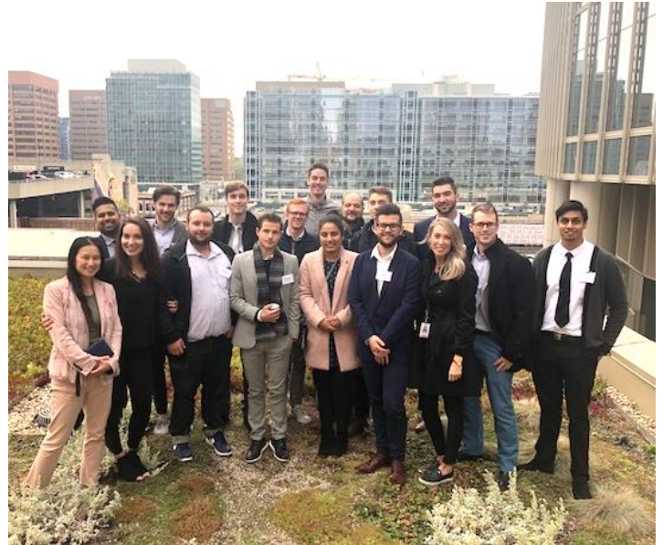
Students on tour at Eighth Avenue Place.